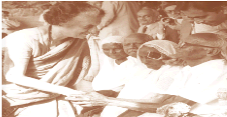
Indira Gandhi visiting Fiji

If ever any news of anyone who visited Fiji from India was given to him he became excited, thrilled and deeply interested and wanted to meet the visitor. This was the reason why when Indira Gandhi visited Fiji in 1981 he urged his local leaders to give him the opportunity to meet her and touch her hands. His wish was granted.