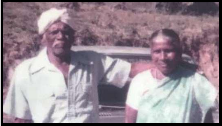
My parents on their farm in Wailevu

He was a man of great belief in God because his family in Rayampuram lived next to the temple and they were regular worshippers there so he always trusted his instinct to do the right things at the right time. He loved his family in Fiji and worked hard to support everyone and guided them to success. Nothing was impossible for him as he used to say because as he put it if we tried hard enough we would be enjoying this short life given to us by Almighty God to prosper and progress at our own pace. He was determined to do his best to ensure that his lost family members in India would feel elated.